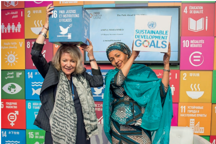
Deputy Secretary-General Amina Mohammed (right) with Alison Smale, Under-Secretary-General for Global Communications, at the SDG Media Zone.

The maintenance of international peace and security is the primary mission for the international system. 4 Given the interconnections between different forms of violence and conflict, effective prevention is only possible if it spans the spectrum of conflict and non-conflict violence. And given the ease with which risks proliferate across borders, a renewed commitment to collective action offers the only path to greater resilience.