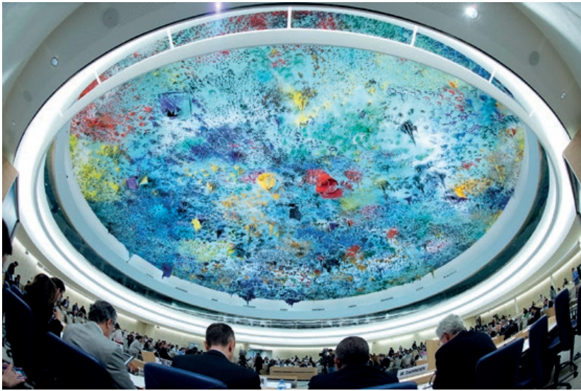
In 2013, the Economic and Social Council (ECOSOC) holds a thematic discussion on its contribution to the elaboration of the post-2015 development agenda.

The envisaged transformation is not only an opportunity for many societies to improve their welfare across social, economic and environmental dimensions, but can also provide significant peace dividends. However, change also implies risks, and system change implies system risks. The SDGs are aiming to overcome the status quo , but without proactive transition governance, this development could undermine geopolitical stability. Consequently, it needs political attention, analysis and guidance. Providing politically informed monitoring and guidance at the interface between the national and international domains is one of the key traditional functions of diplomacy, as is its responsibility for maintaining and extending the zone of peace and stability. Hence, diplomacy needs to seriously analyse and engage with the SDGs.