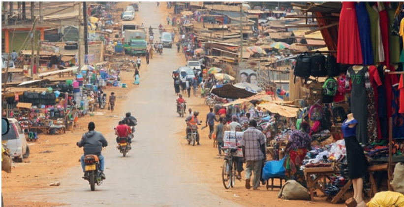
A road in Mukono, Uganda. Shortages of water and arable land can worsen existing ethnic and political tensions or cause old animosities to flare up.

Development cooperation has always been political to a certain extent, but it was further politicised in recent years as fragility became of greater interest to a broader spectrum of actors. This has come about due to the realisation that a stable and prosperous world is in everyone's interest – from economic, environmental, political, social and security perspectives – and thus all actors, at all levels of the international system must work together to make that vision a reality. If they do not, this current surge of crises and the existence of powerful threats call into question the future that people expect and that people deserve. 16 As Federal Chancellor Angela Merkel noted on the commemoration of the centenary to mark the end of World