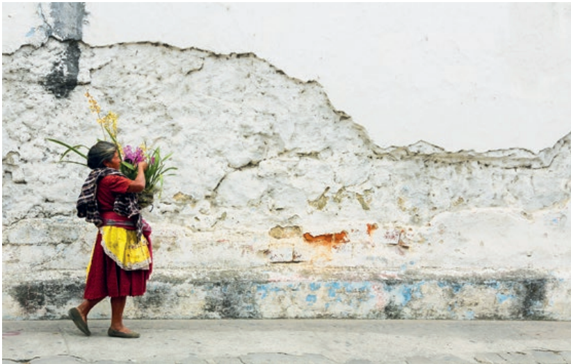
A woman carries a basket of flowers next in Antigua, Guatemala. Fragile contexts consistently rank in the bottom third of the 157 countries for which data on SDG progress is available.

which are also fragile – in fact, over half of the 58 contexts on the OECD’s 2018 Fragility Framework are middle-income – supports the notion that there is more to fragility than economic growth and poverty, 3 as has the rising incidence of middle-income countries experiencing conflict. 4 Moreover, many countries have considerable variation of fragility within their borders, and these “pockets of fragility” – whether due to poverty, conflict, or both – demonstrate why fragility continues to confound simplistic and mono-dimensional categorisation.