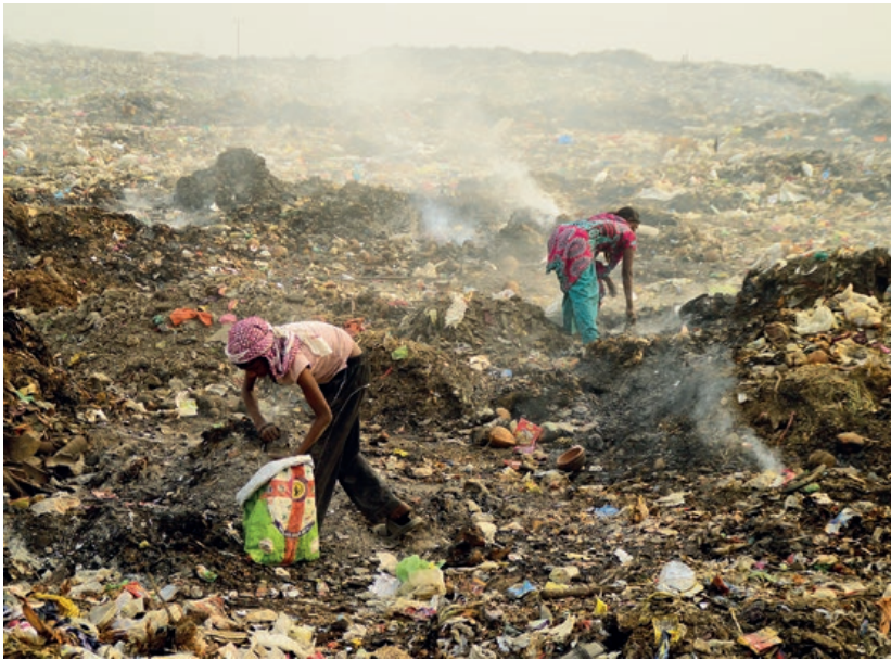
Rag pickers search for recyclable material in the garbage in Amravati, Maharashtra (India), in 2014.

From “SDG-referencing” to additional action: Firstly, notwithstanding some “best practice cases”, a big pending question is whether the SDGs guide business action and lead to additional measures at a company level. For example, a survey of 250 larger companies across sectors and continents found that 44 per cent merely reflect on the positive relationship between SDGs and their corporate strategy, while 41 per cent took concrete measures to integrate SDGs in their company; some companies do not yet take the framework into account, and some have just begun to think about SDGs. 18 With regard to reporting, companies differ in how they take the SDGs into account: some only mention them, others relate them to existing strategies. Furthermore, small and medium size companies are very reluctant to adopt or implement the SDGs.