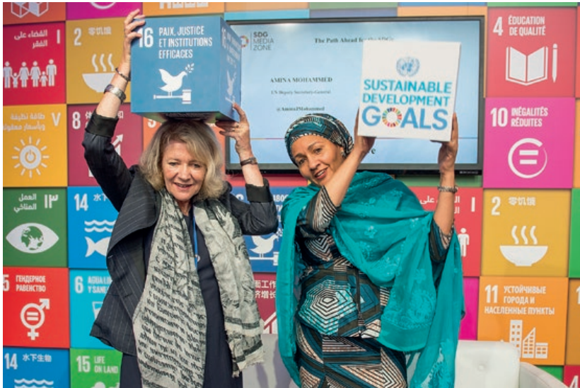
Deputy Secretary-General Amina Mohammed (right) with Alison Smale, Under-Secretary-General for Global Communications, at the SDG Media Zone.

The maintenance of international peace and security is the primary mission for the international system. 4 Given the interconnections between different forms of violence and conflict, effective prevention is only possible if it spans the spectrum of conflict and non-conflict violence. And given the ease with which risks proliferate across borders, a renewed commitment to collective action offers the only path to greater resilience.