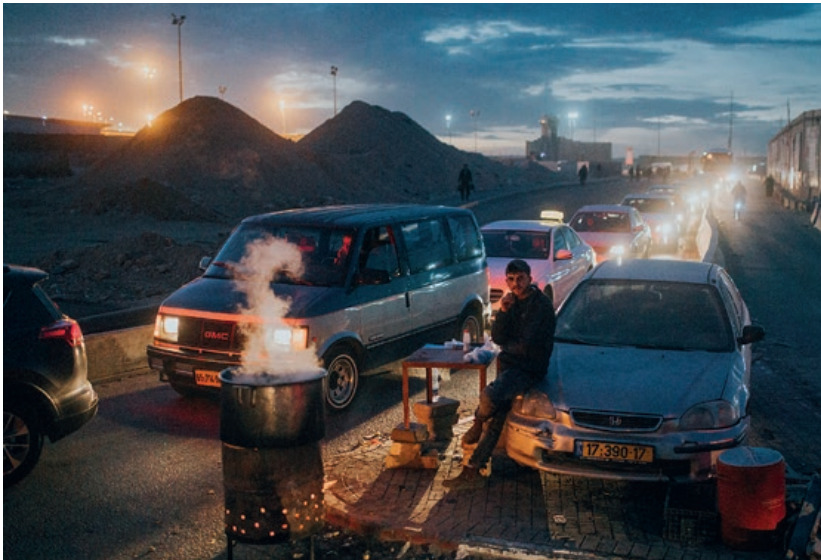
A man waiting by the cars going through a checkpoint in Ramallah, Palestinian Territories.

By asking, “What would it take to halve global violence in a generation?” foreign policy actors can begin to galvanise the partnerships that are needed to make a more ambitious approach to prevention possible.