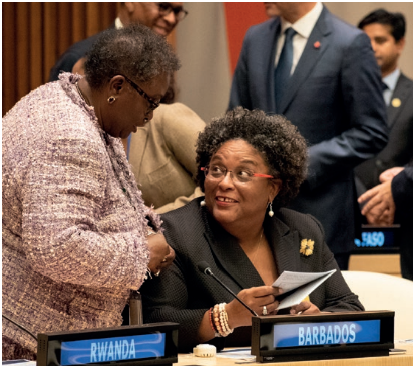
Mia Mottley, the Prime Minister of Barbados during a high-level UN panel discussion on financing the 2030 Agenda.

There is, however, also the possibility that reduced internal grievances and stronger, internally more legitimate states could unleash greater interstate competition. China's development over in recent decades, and the fact that China alone accounts for much of the progress on the SDG's predecessors, the Millennium Development Goals, might be a good reason for questioning liberal assumptions about likely socio-political effects of development gains. Yet such doubts about the ultimate results of SDG implementation only reinforce our key message: the need for foreign policy foresight and political guidance in SDG implementation.