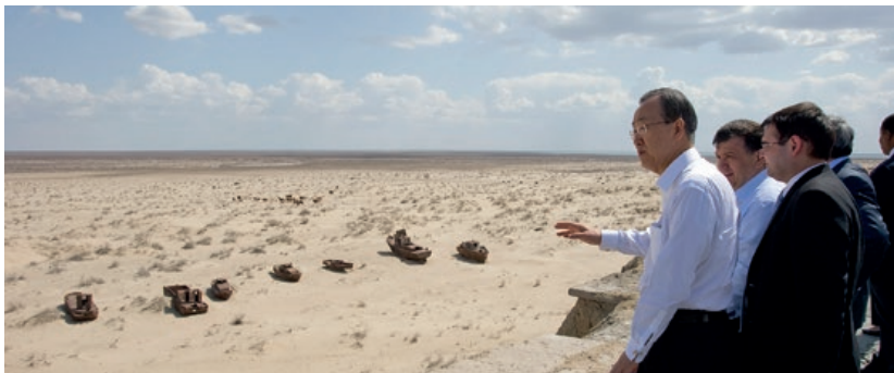
Accompanied by Uzbek Prime Minister Shavkat Mirziyoyev (second from left), Ban Ki-moon, former UN Secretary-General (left), takes in the rusted, abandoned ships of Muynak, Uzbekistan, a former port city whose population has declined precipitously with the rapid recession of the Aral Sea.

Central Asia offers a prominent example of how political factors can make the search for win-win solutions difficult, and how foreign policy can help advance such efforts. Since the dissolution of the Soviet Union, the Aral Sea basin has witnessed significant conflict over water. Upstream countries inherited big Soviet reservoirs that had primarily been built to boost downstream irrigation in summer for cotton production. However, as upstream countries' energy costs rose post-independence, they started releasing more water for hydropower generation in winter. Uzbekistan, whose economy has