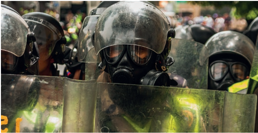
In Caracas, Venezuela, the police block the pace of a demonstration.

in Latin America, are as high as in many war zones. Beyond the human impact, this poses political challenges. Gangs displace governments and offer a form of security and justice to the communities they control. 14 The resulting violence is contagious in three ways. Most immediately, it “follows an epidemic-like process of social contagion” as it spreads through social networks. 15 More broadly, it undermines a society’s resilience, as institutions and politicians are corrupted and implicated. 16 And over the longer-term, cycles of violence are perpetuated, as children are raised to believe that violence is normal or inevitable.