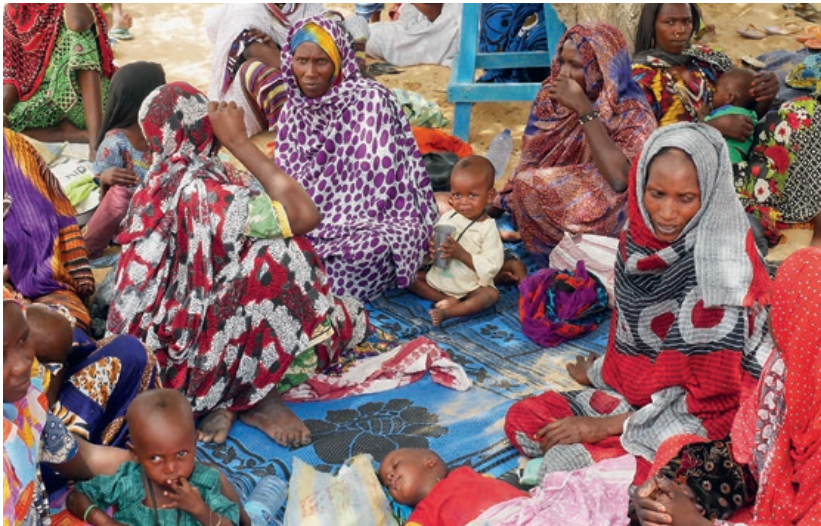
Internally displaced people in Bol, in Sahelian Chad located on the coast of Lake Chad. It is projected that by 2030 more than half of the people living in poverty will be found in countries affected by high levels of violence.

Fragility has already demonstrated, with worrying and convincing force, why it has the potential to be the single biggest spoiler to the ambitions behind not just the SDGs, but also to sustaining peace, efforts to adapt to climate change, as well as other key geopolitical priorities. Addressing it must therefore be a collective priority for the development, diplomatic as well as defence communities. Smarter approaches to engaging in contexts affected by fragility, including through foreign policy channels, could help ensure that investments in tackling fragility are maximised, and worth every cent.